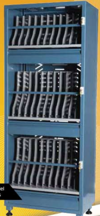
'30 Bay (3 Tier)' model with lockable shelves

Solid steel welded construction; Designed & manufactured in Australia; Powder coated, stylish finish